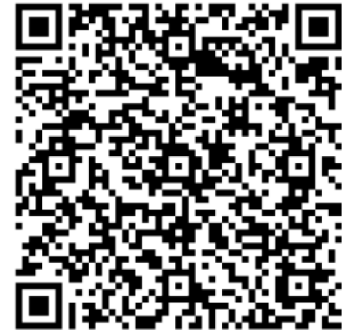
Fig. 2: Feel free to embed your images.

similique sunt in culpa qui officia deserunt mollitia animi, id est laborum et dolorum fuga. Et harum quidem rerum facilis est et expedita distinctio. Nam libero tempore, cum soluta nobis est eligendi optio cumque nihil impedit quo minus id quod maxime placeat facere possimus, omnis voluptas assumenda est, omnis dolor repellendus. Temporibus autem quibusdam et aut officiis debitis aut rerum necessitatibus saepe eveniet ut et voluptates repudiandae sint et molestiae non recusandae. Itaque earum rerum hic tenetur a sapiente delectus, ut aut reiciendis voluptatibus maiores alias consequatur aut perferendis doloribus asperiores repellat.